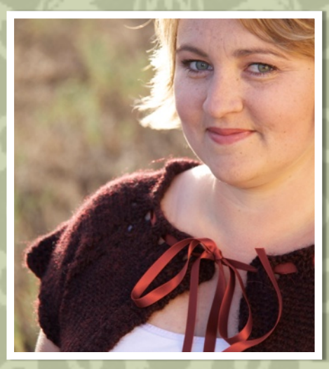
All text and images copyright ThemKnits 2010