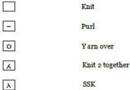
Chart of Lace Pattern