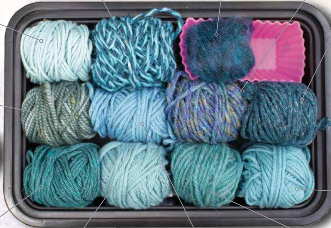
Berroco Bento Box Color Mizo/Water $24.95

Inspired by the Japanese box-style meal, Berroco Bento Boxes are the most convenient way to "taste" many of Berroco's tantalizing yarns and explore their different textures. Each box includes 15 yards each of some of Berroco's newest yarns, as well as stash staples!